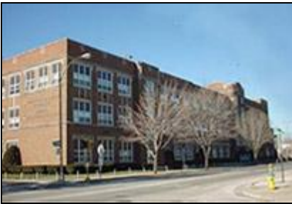
S.E. Gross Middle School 3524 Maple Ave. Brookfield, IL 60513