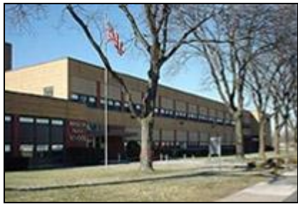
Brook Park Elementary School 30 th and Raymond LaGrange Park, IL 60526